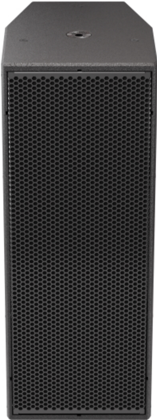
dbTechnologies IS 210L

Equipped with the same transducers as the IS 210L, and also in a symmetrical configuration, the IS210T point-source loudspeaker has a 90x40 rotatable horn. Using the same accessories available with the ViO X310, the IS210T sound reinforcement is adaptable to flyable or pole-mount installations, making it suited for a variety of applications. The line and point source are available in two colors: black and white. On the white version, the color finish is customizable.