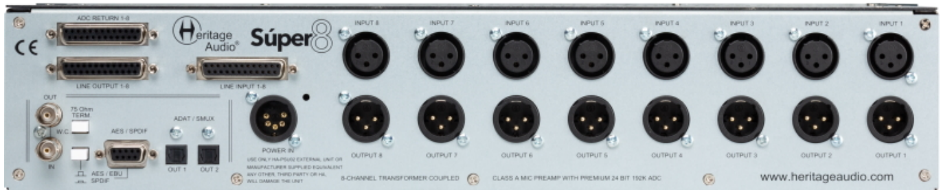
Heritage Audio Súper 8

But best of all, Súper 8 incorporates a premium ADC to make sending signals to a DAW as easy as possible. Put it this way: the 24-bit ADC concerned offers selectable sampling frequencies ranging from 44.1kHz to 192kHz, as well as the option of syncing it to external wordclock. With three different digital output options - ADAT/SMUX, AES/SPDIF, and AES/EBU - available, connecting a Súper 8 to any audio interface, whether wallet-friendly or otherwise, transforms it into a high-quality professional recording rig.