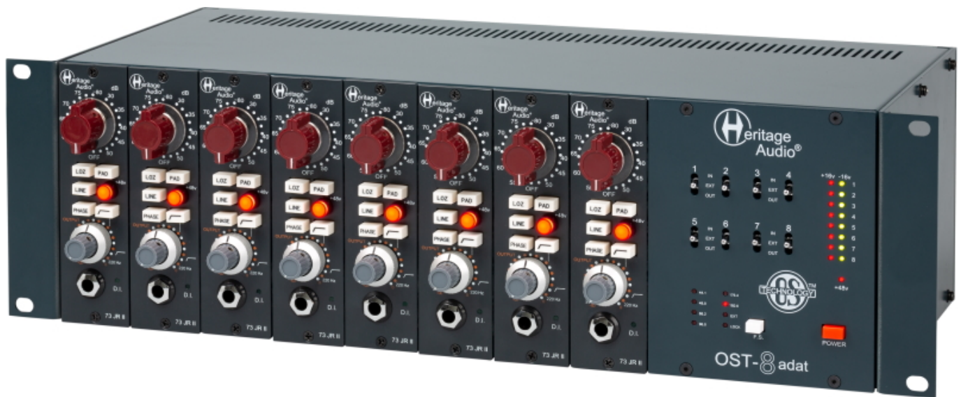
Heritage Audio OST-8 adat

OST-8 adat also includes Heritage Audio's tried-and-tested OS Technology™ to guarantee the cleanest, most protected environment for its users' favoured 500-Series modules - not only offering unmatched filtering and isolation for each slot, but also ensuring the best performance possible as every module is individually isolated and regulated to provide it with its own power supply to ensure that it will perform at its peak potential, unhindered by any other 'power hungry' or even faulty modules. Interference is reduced as a result, and many 500-Series devices actually exhibit lower self-noise attributes and better performance when racked in an OST-8 adat enclosure - especially mic preamps.