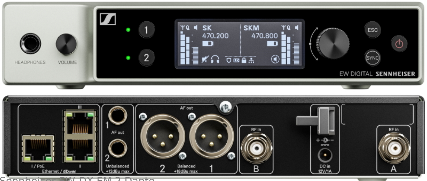
Sennheiser EW-DX EM 2 Dante

Sennheiser, the first choice for advanced audio technology that makes collaboration and learning easier, has announced that new components of the EW-DX microphone system are shipping and available to customers. With initial components released last year, EW-DX simplifies professional workflows by utilizing refined technologies to deliver a digital UHF system that can be scaled with ease.