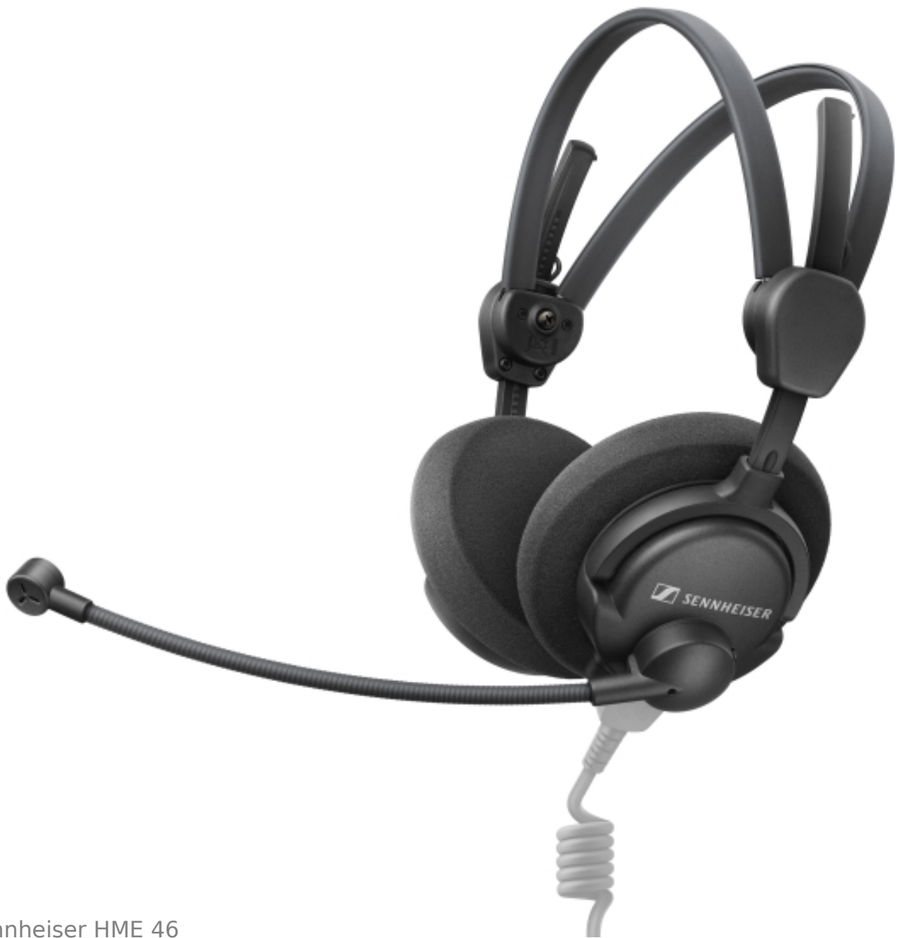
Sennheiser HME 46

Neumann's reference-class audio interface MT 48 will be shown with both the Music Mission for content creation and the brand new Monitor Mission. The latter turns the device into a freely configurable monitor controller and audio interface for stereo, surround and immersive formats. The MT 48 will also be used for demoing Neumann's KH line of studio monitors as well as the NDH 20 closed-back and NDH 30 open-back headphones.