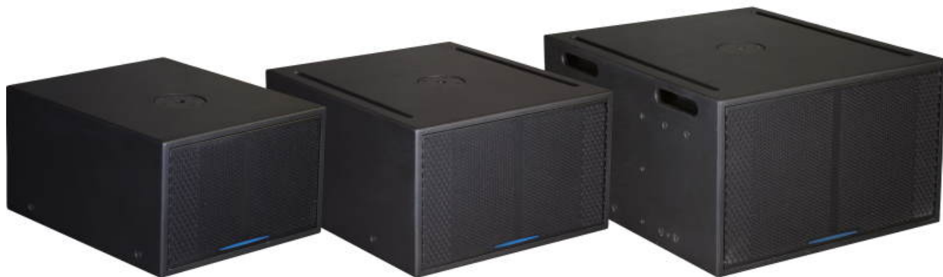
APG iS Series HD

APG, the inventor of the modular line-array system, is returning to ISE with a bang to showcase a new series of loudspeakers, subwoofers and amplifiers. The manufacturer of professional loudspeakers made in France will also take this opportunity to present its brand-new visual signature. Inspired by the iconic blue border dear to the brand since its creation in 1978, and symbolising the sound precision and fidelity on which APG has built its reputation, the new logo will now act as an integrated visual element on all products. Both elegant and discreet, this signature will be part of a new generation of round perforated grilles that are perfectly integrated into the loudspeakers' enclosure.